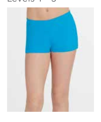
BOY CUT LOW RISE SHORT TB113/TB113C