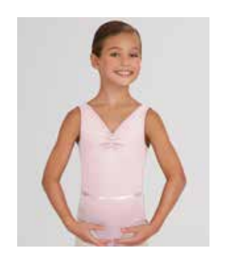
V-NECK PINCH FRONT LEOTARD W/BELT TC0002

Kinder Jazz, Pre Junior Jazz, Acro Minis & Mini Tappers