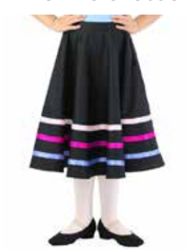
CHARACTER SKIRT CHARSKT/C All Grades 1 - 8