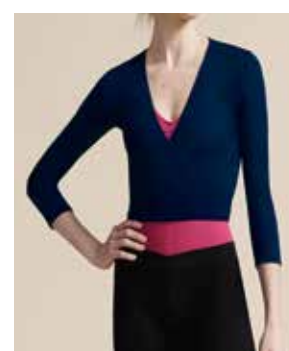
CROSS-OVER TOP TC0010