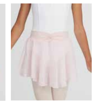
V-NECK PINCH FRONT PULL-ON GEORGETTE V-NECK PINCH FRONT SKIRT N9635C

Kinder Ballet, Pre-Primary Ballet & Primary Ballet