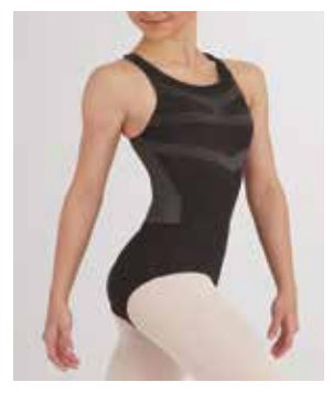
MOSAIC RACER BACK TANK LEOTARD TC0017W