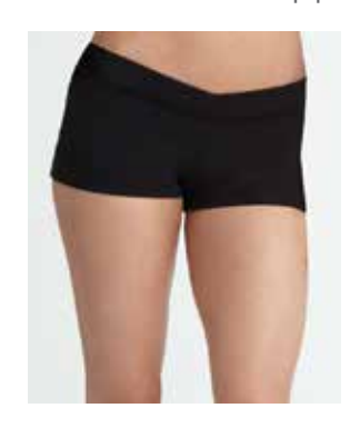
BOY SHORT CC600 or TC0055C