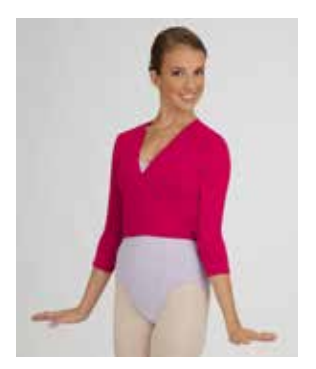
CROSS-OVER TOP TC0010