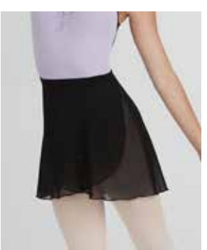
WRAP SKIRT (OPTIONAL) TC0009