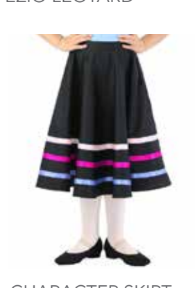
CHARACTER SKIRT CHARSKT/C. All Grades 1 - 8

BURGUNDY FULL CIRCULAR, MID-CALF, CHIFFON SKIRT ALSO REQUIRED & MATCHING CROSSOVER