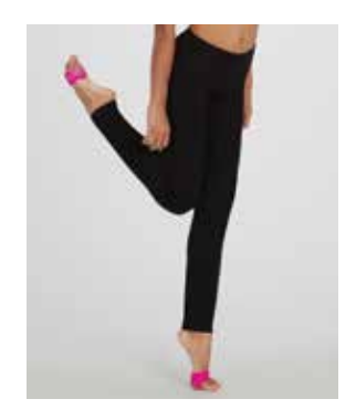
LOW-RISE ANKLE LEGGING CC751