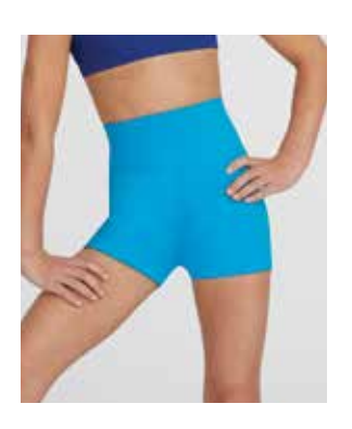
HIGH WAISTED SHORT TB131/TB131C