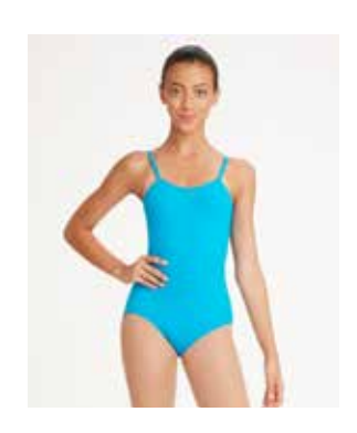
ANY TURQUOISE LEOTARD