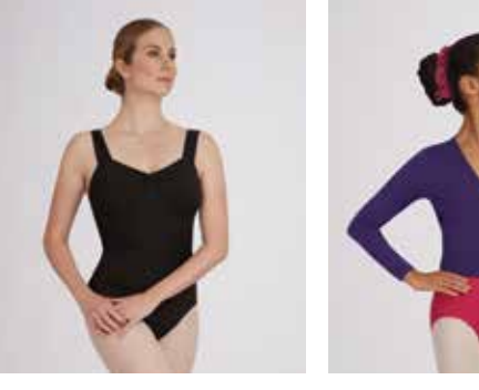
STUDENT CHOICE - CLASSICAL BLK STYLE*