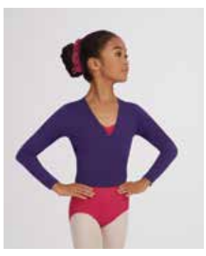
CROSS-OVER TOP TC0010 (NAY or PUR)