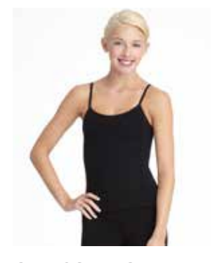
CAMISOLE TOP TB104