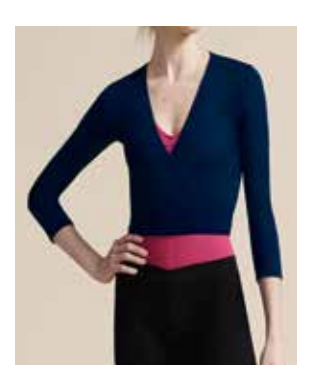
CROSS-OVER TOP TC0010