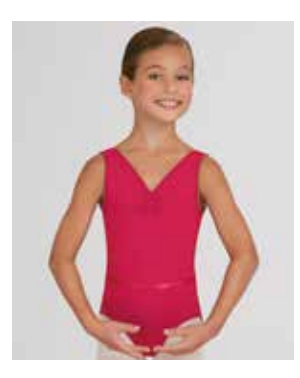
LEOTARD W/BEIT TC0045C