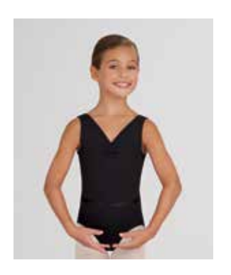
V-NECK PINCH FRONT LEOTARD W/BELT TC0002